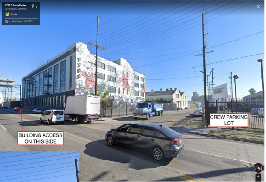
BUILDING ACCESS ON THIS SIDE